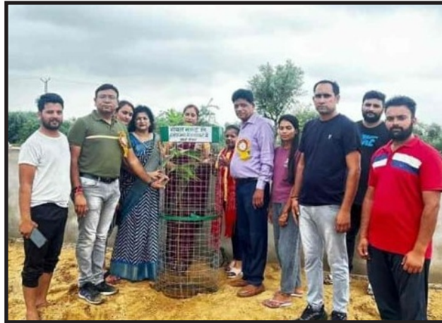
ENVIRONMENTAL SUSTAINABILITY BY PROVIDING TREE GUARDS FOR PROTECTING AND NURTURING THE TREES IN TEHSIL OFFICE, NAWA.