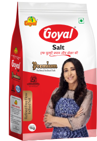
Goyal Premium Refined Free Flow Iodised Salt