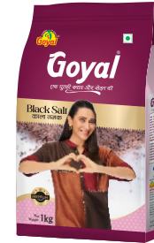
Goyal Black Salt Natural Ingredients Flavor Salt