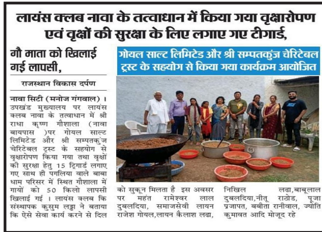
TOWARDS ANIMAL WELFARE AN ENVIRONMENTAL SUSTAINABILITY