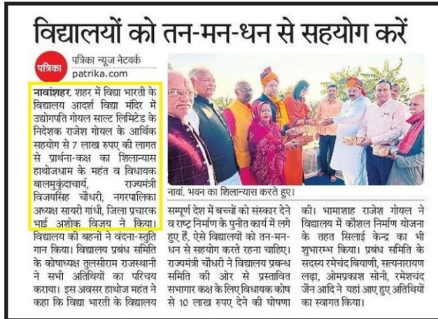
INFRASTRUCTURE FACILITY TO SCHOOL FOR PROMOTING EDUCATION