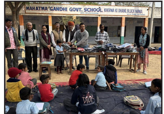
DISTRIBUTION OF WOOLEN CLOTHES