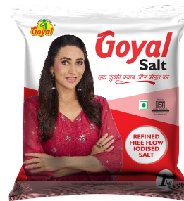
Goyal Salt Refined Free Flow Iodised Salt