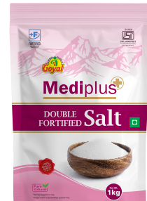
Medi Plus Double Iron Fortified Salt