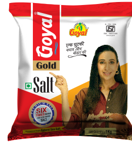
Goyal Gold Refined Free Flow Iodised Salt