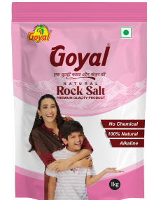
Goyal Pink Salt Natural Rock Salt